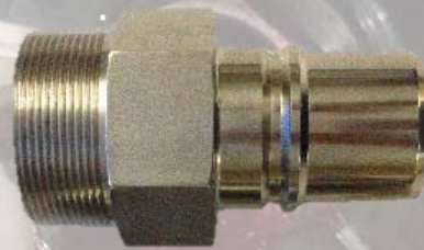
2" NPT Style 971-2127-01 Shown