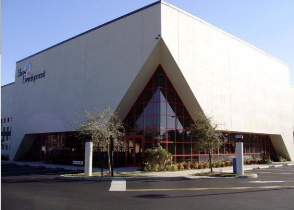
The Shaw Commercial Series Products are custom designed to fit your specific needs.

For pressurized systems only, this check valve offers the same feature that the Shaw Development Non-Pressurized Refueling Systems in that it will allow a receiver to be changed in the field without emptying the fuel tank, and will help prevent the unauthorized removal of fuel thru the receiver.